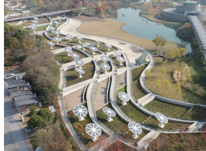
Zero Carbon Park Jiangsu Province, China | 90 kW + 147 kW