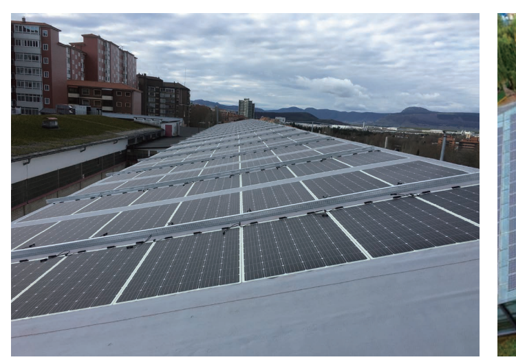
Waterproof Membrane Roof Spain | 80kW