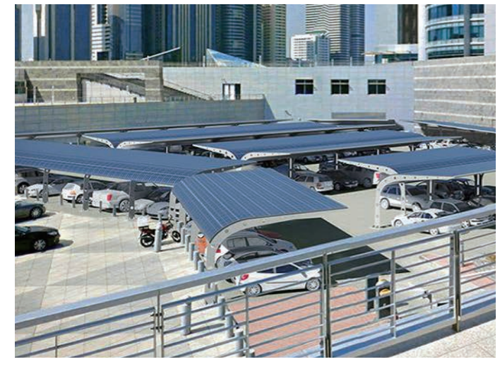
Curved Carport UAE | 273kW