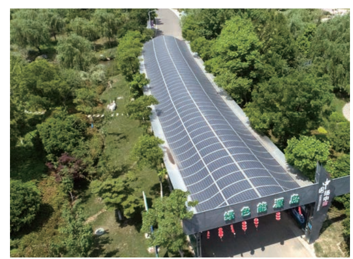
Curved Roof Jiangsu Province, China | 56kW