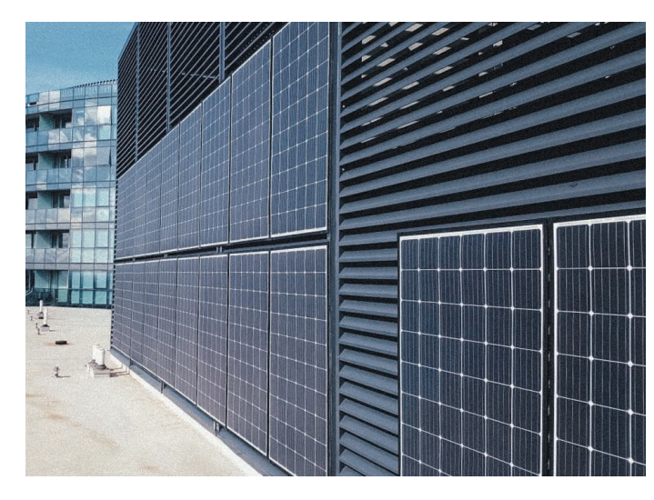
Solar Façade Australia | 40kW