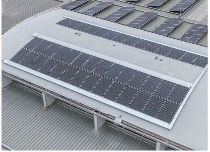
Curved Roof Australia | 120kW