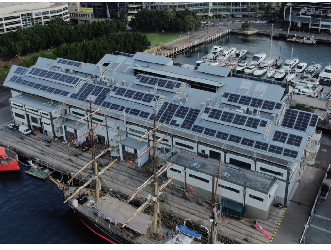
Lightweight Metal Roof Australia | 235kW