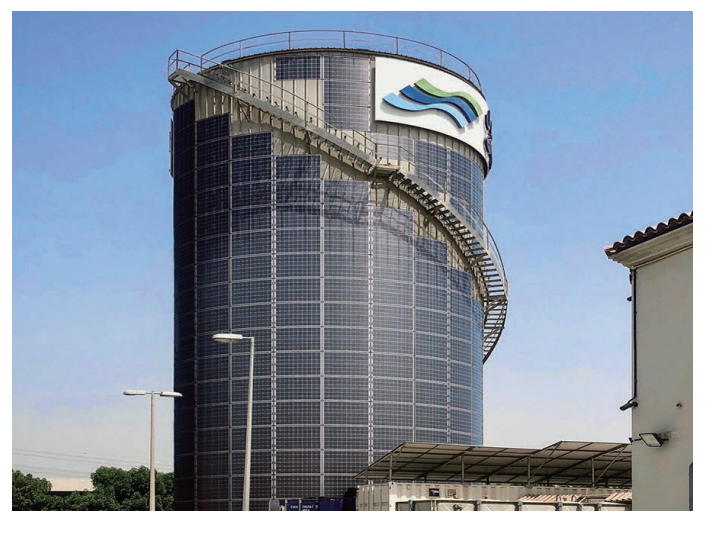
Solar Façade UAE | 50kW