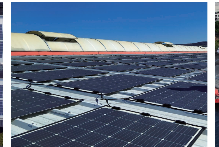
Lightweight Metal Roof Czech Republic | 100kW