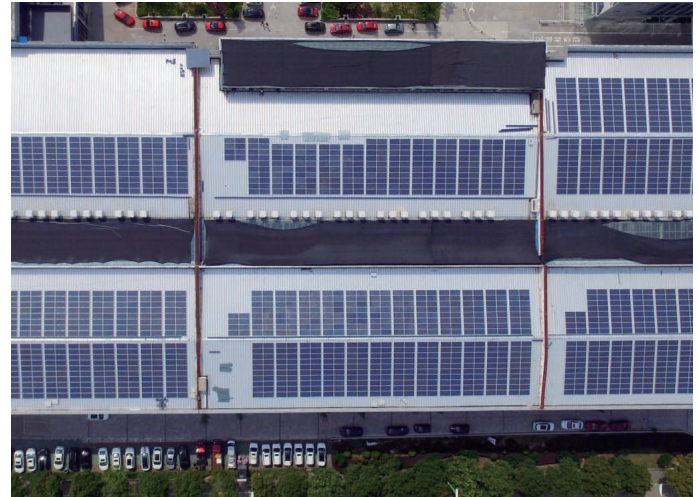
Lightweight Metal Roof Zhejiang Province, China | 600kW